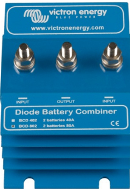
Argo Diode Battery Combiner BCD 802

Diode battery combiners are used to guarantee continuous DC power to mission critical equipment, such as an electronic engine control system. With a diode battery combiner two or more DC power sources can be used in parallel to supply the mission critical load. Failure of one source will not interrupt power to the critical load.